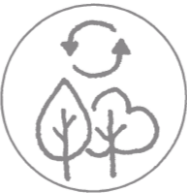
renewable raw materials