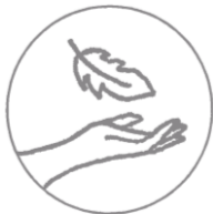
gentle to the skin