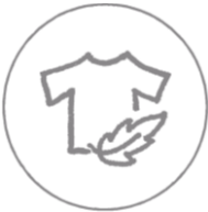
high wearing comfort