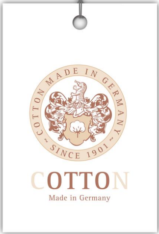
Cotton since 1901® quality seal