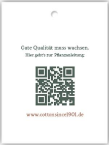
Hangtags with cotton seeds