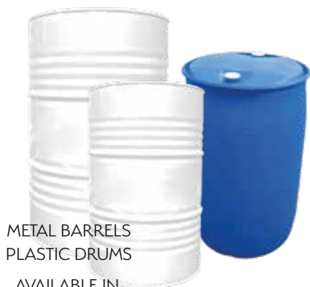
METAL BARRELS PLASTIC DRUMS