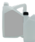
BELUGA NATURAL AVAILABLE ONLY FOR AQUEOUS FLUIDS