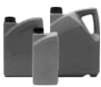
SE NATURAL GREY BLACK