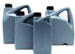
DURAND D05 NATURAL GREY