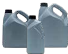
PGA NATURAL GREY