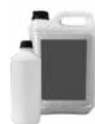
STANDARD NATURAL CHARCOAL GREY