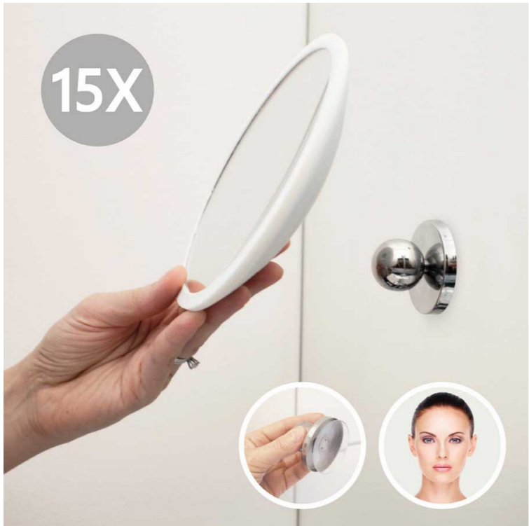
Detachable Make-up Mirror, Airmirror™