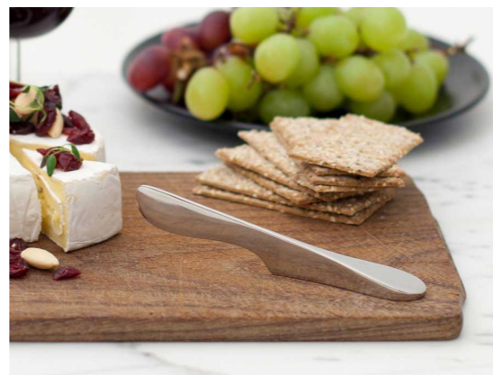
Self Standing Spreader Knife Air