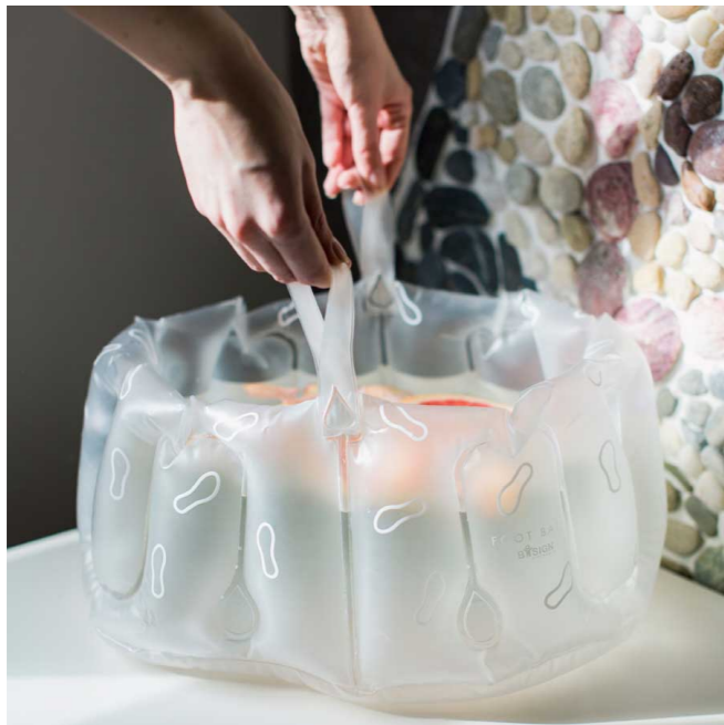
Inflatable Foot Bath