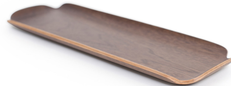
Countertop Tray Leaf, Oil and Water proof