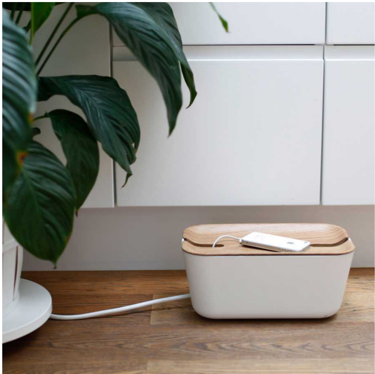
Cable Organiser Hideaway™