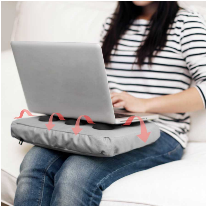
Surfpillow for laptop