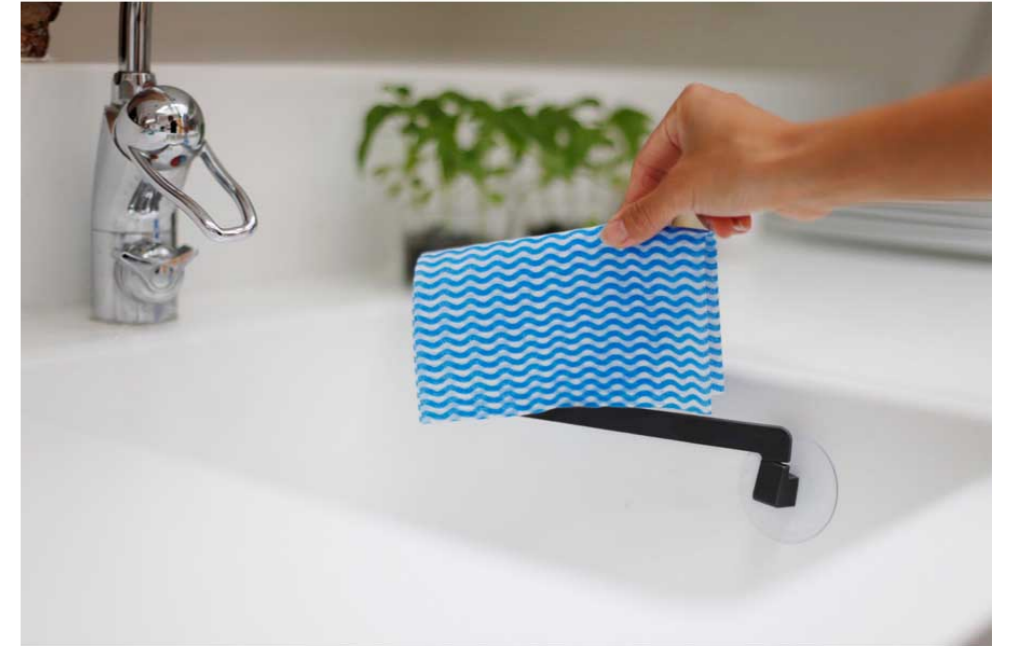
Dish Cloth Holder