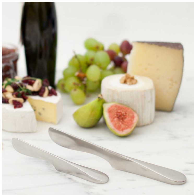
Self Standing Spreader Knife Air