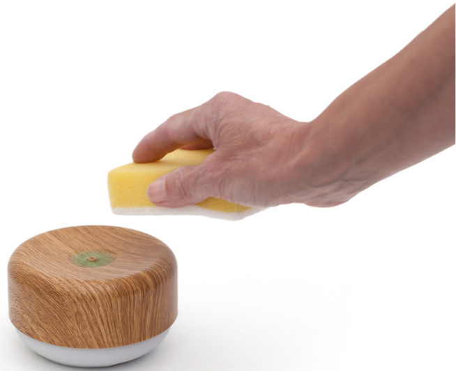
Dish Soap Dispenser Do-Dish™