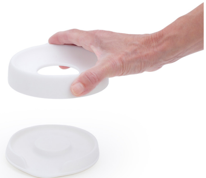
Soap Saver Dish with Self Draining Spout, Flow™