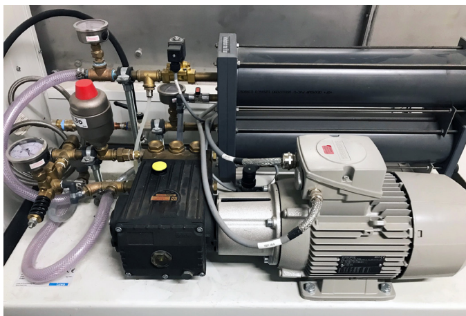
High Pressure water pump skid provides RO filtered water in a once through system for hygienic humidity control. Chilled water coils in the Evercool unit provide cooling.