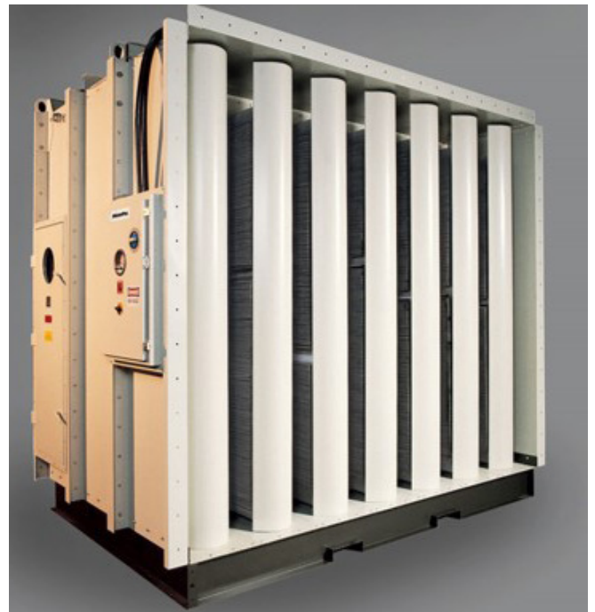
The RPB filter is the most compact, efficient, and reliable filter for effectively handling SAP in a single stage.