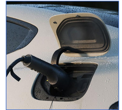
IP55 Rain and dust proof design