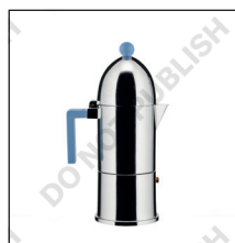
CODE 9095/6AZFM BLUE COLOUR CL 30 - Ø CM 10 - H CM 28,5