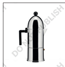
CODE 9095/6BFM BLACK COLOUR CL 30 - Ø CM 10 - H CM 28,5