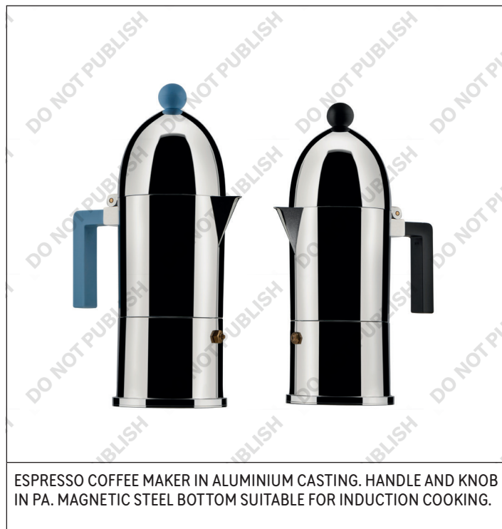
ESPRESSO COFFEE MAKER IN ALUMINIUM CASTING. HANDLE AND KNOB IN PA. MAGNETIC STEEL BOTTOM SUITABLE FOR INDUCTION COOKING.

Cast aluminium. The magnetic steel base is also suitable for induction hobs. Handle and cap made of thermoplastic resin, black or blue. Only available with a 6-cup capacity.