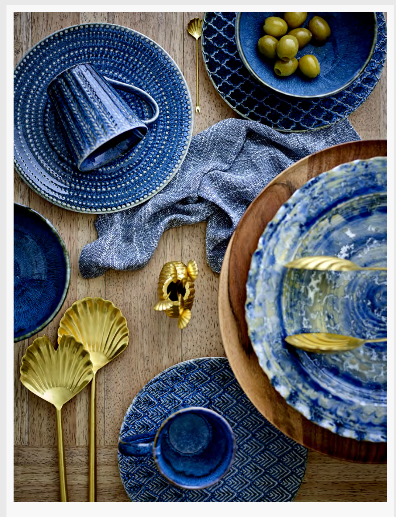
. Elanor Dinnerware . Loreta Salad Servers . Loreta Tong . Heidi Napkin .