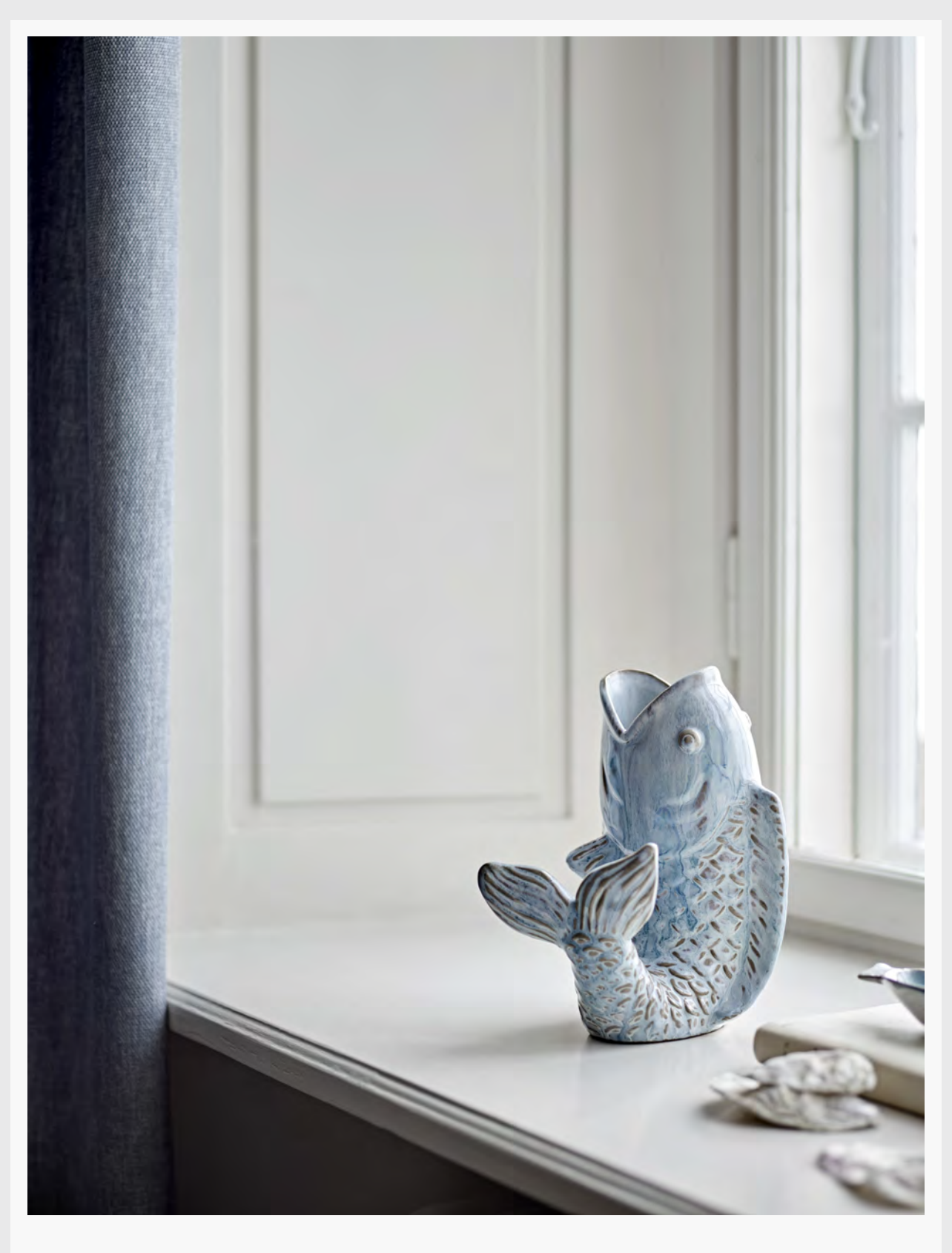
. Hiro Vase .