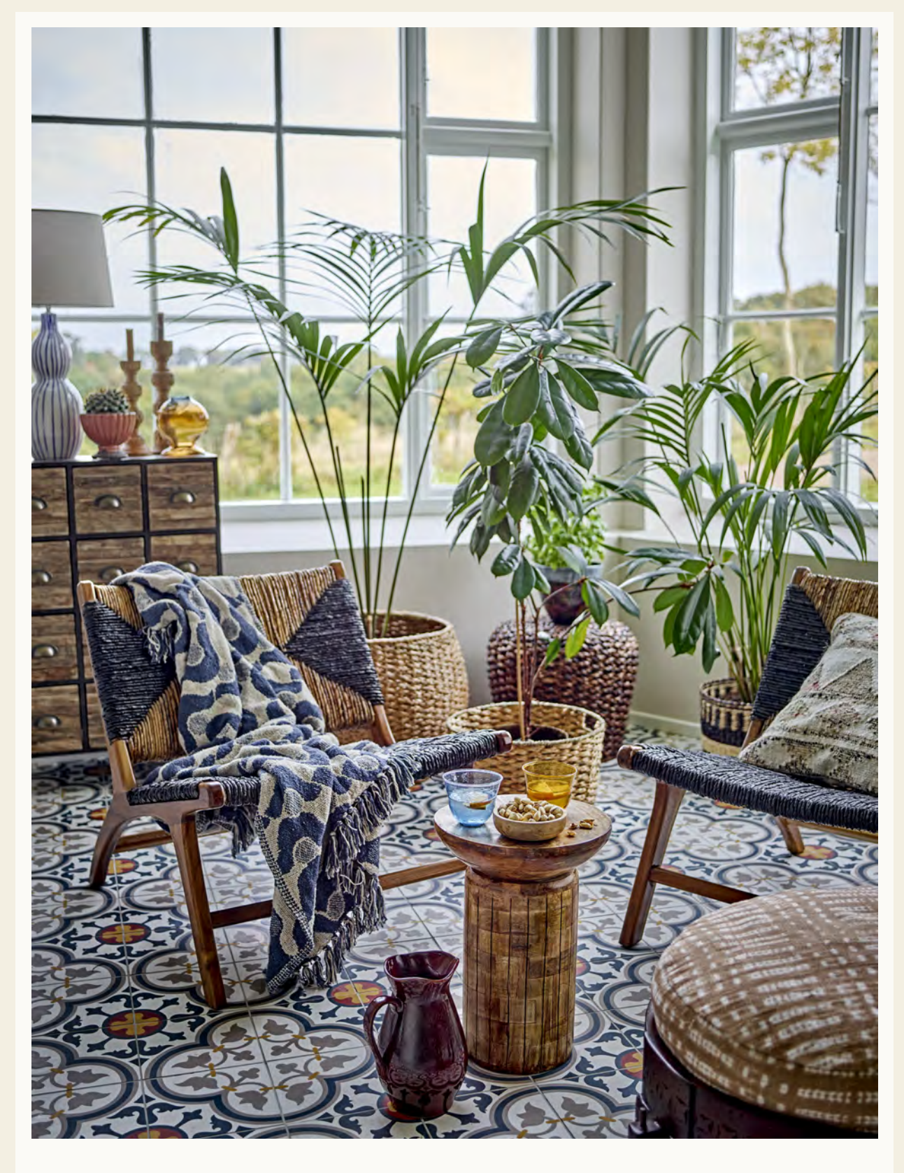
. Grant Lounge Chair . Santena Throw . Dahlia Jug . Yasme Side Table . Nona Cushion .