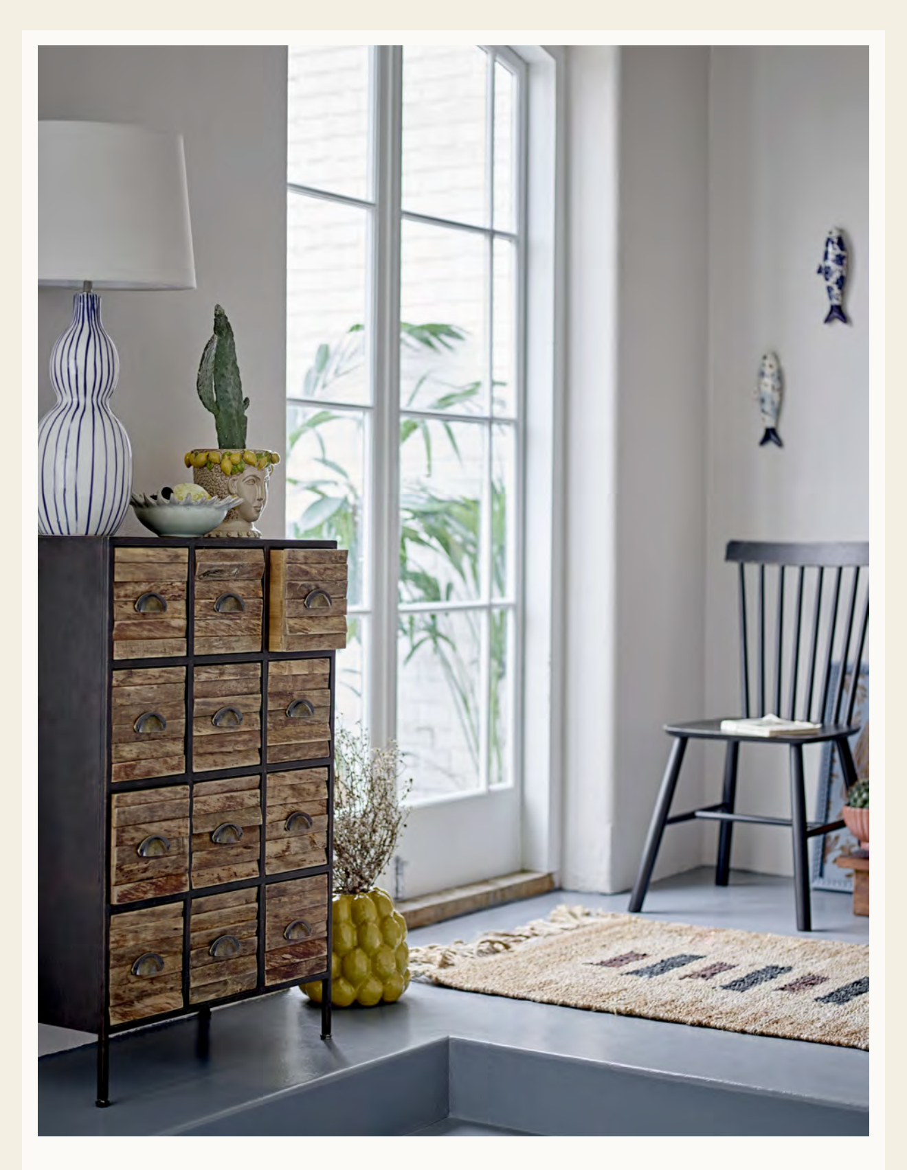
. Gavisa Table Lamp . Matteo Drawer . Limone Vase. Mill Dining Chair . Vilde Rug .