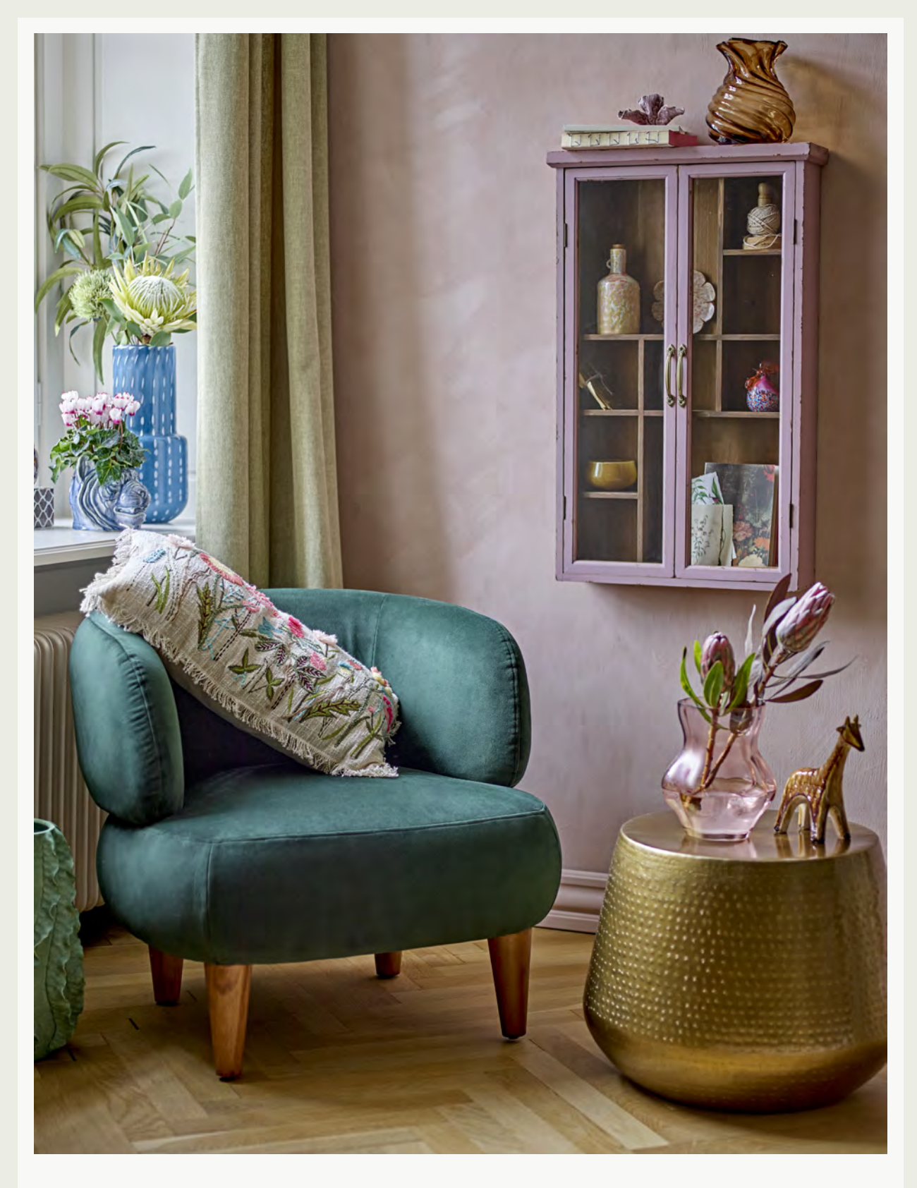
.Mayim Vase . Ruperta Lounge Chair . Tetti Cushion. . Hazem Cabinet . Avola Coffee Table . Tava Vase . Longuro Deco .