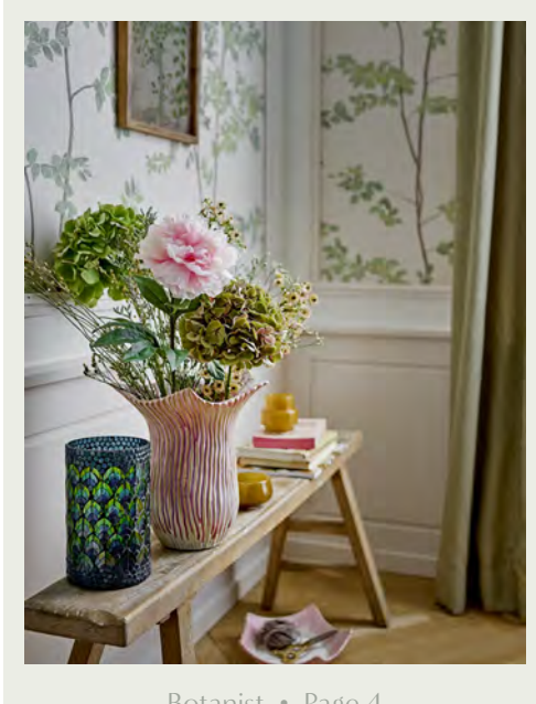
Botanist • Page 4