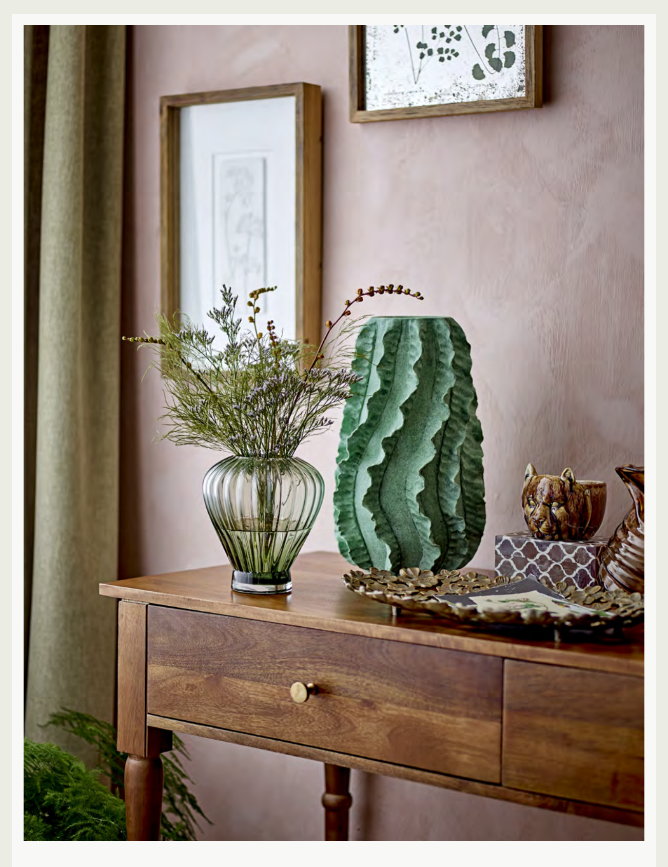
. Betton Console Table . Reeve Vase . Natika Vase .