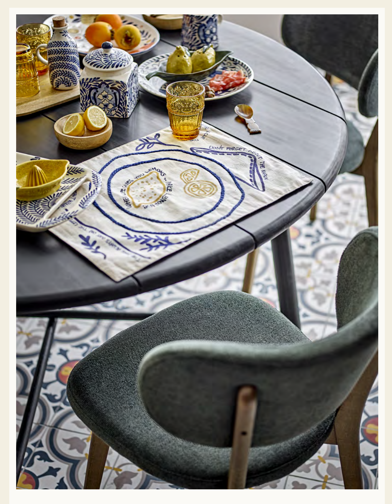
. Lope Dining Table .Cally Dining Chair . Limone Placemat . Feyza Drinking Glass .