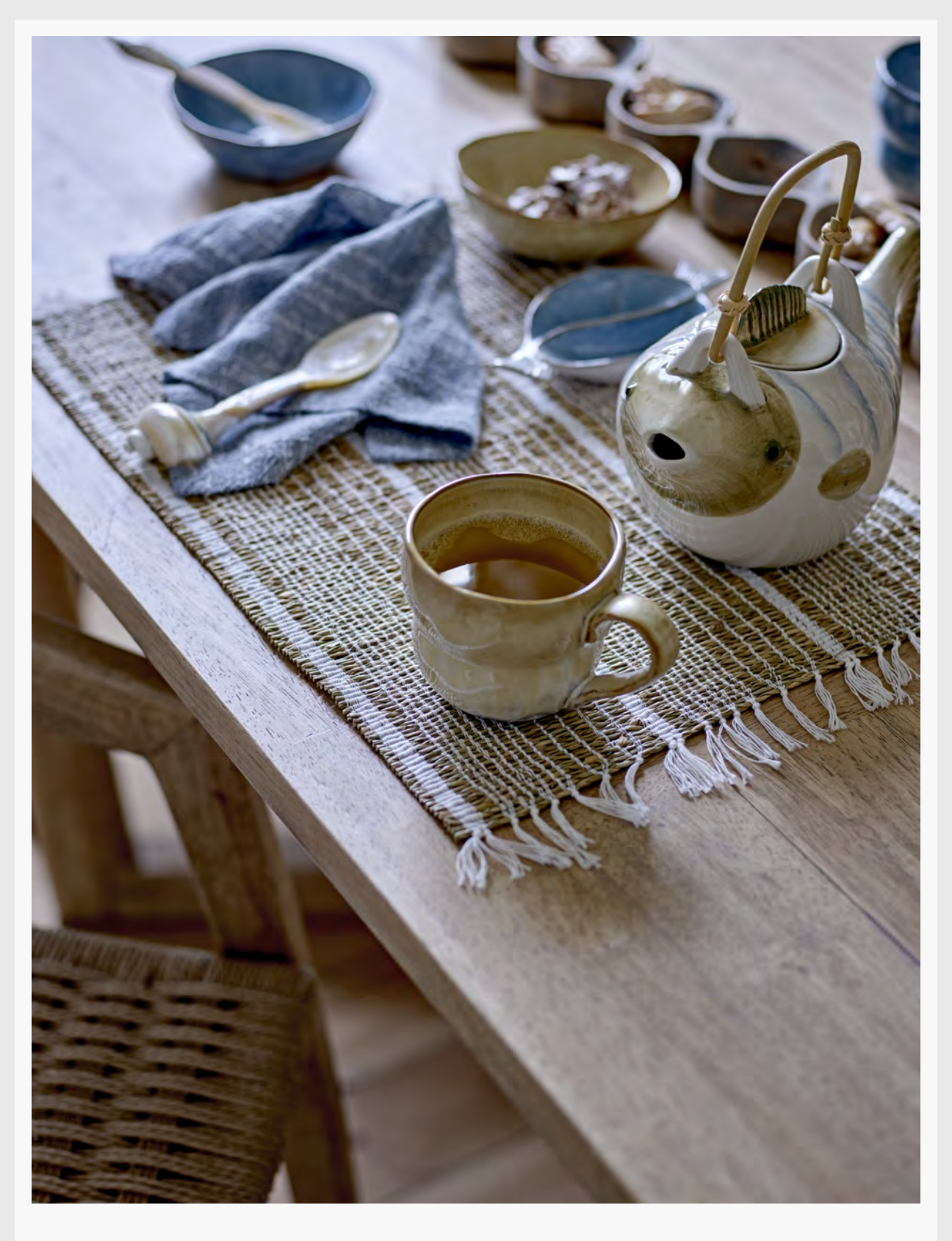
. Vidan Placemat . Nara Cup . Wrenna Teapot .