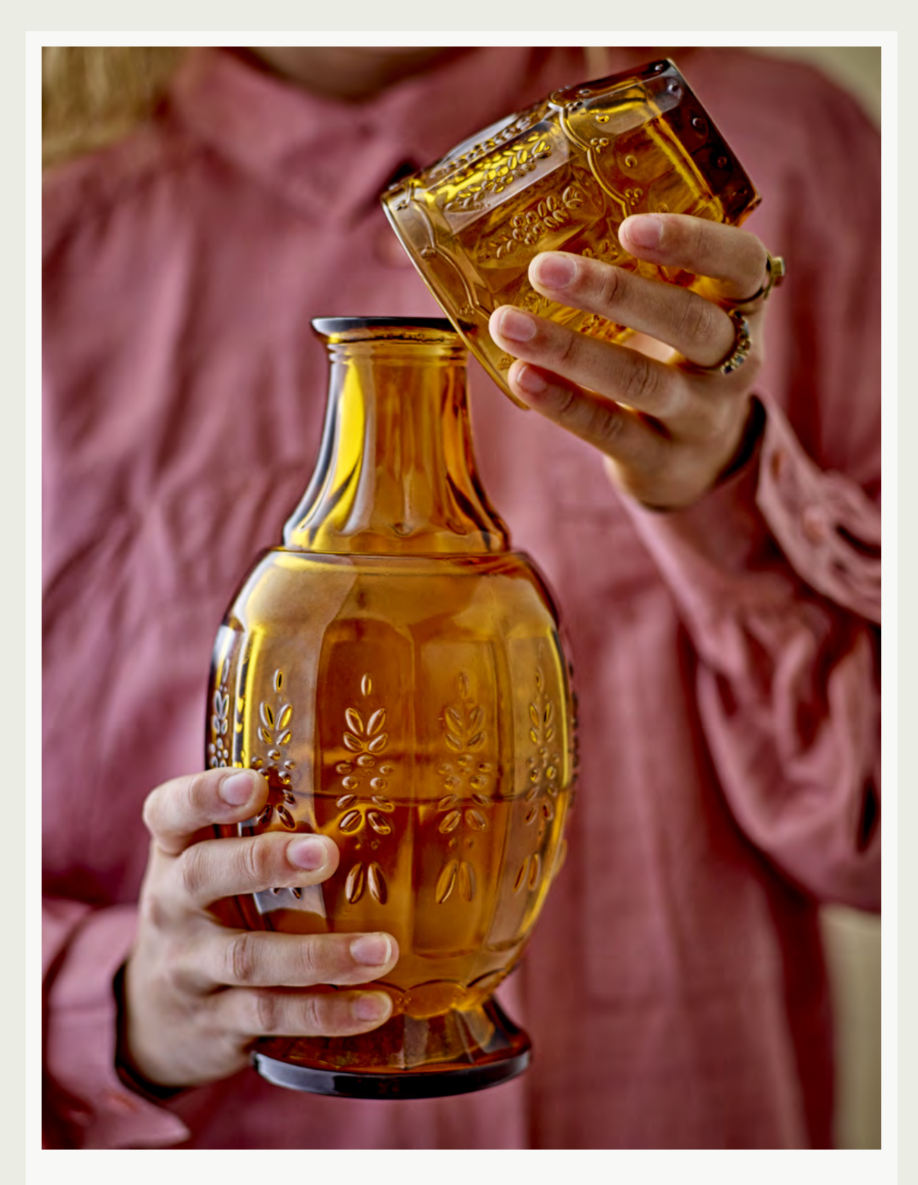
. Theon Decanter & Glass .