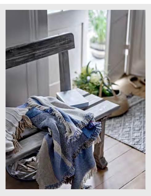
Cottage • Page 16