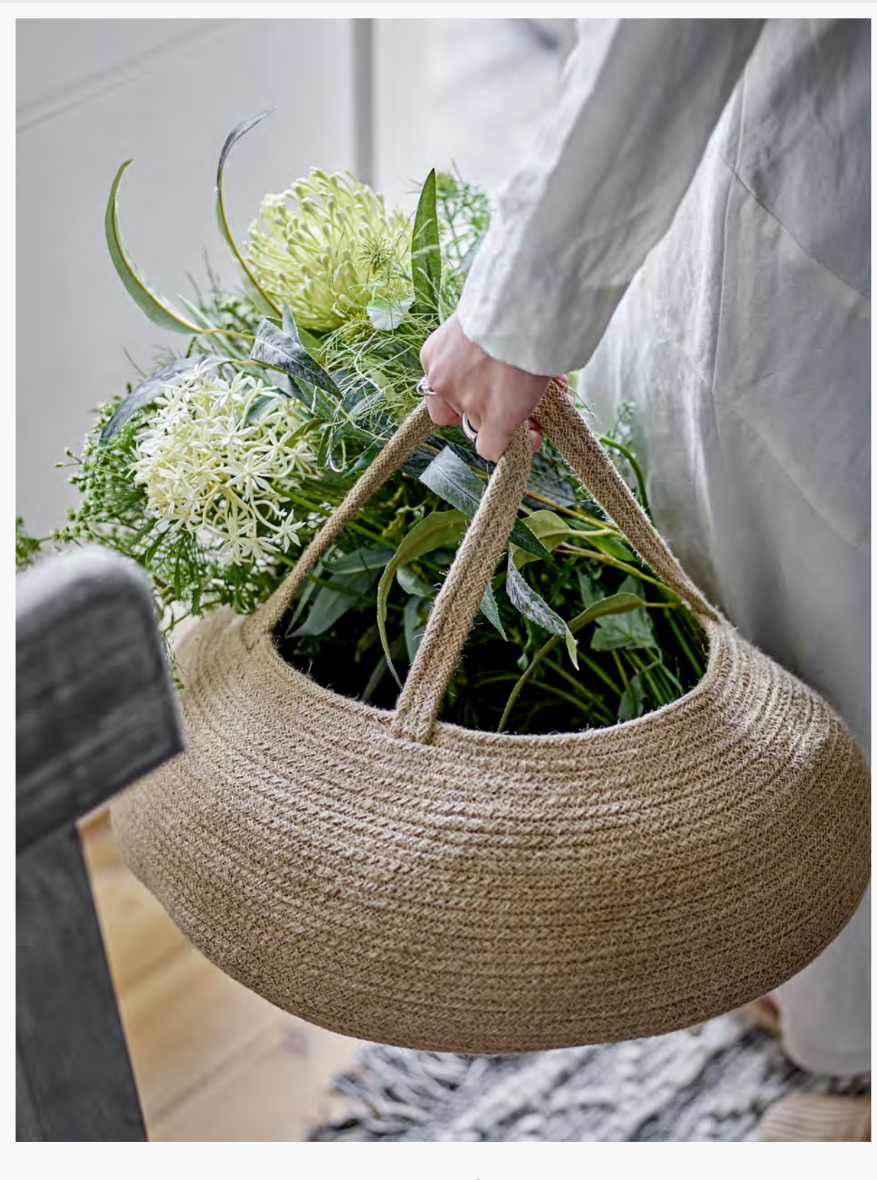
. Nomie Basket .