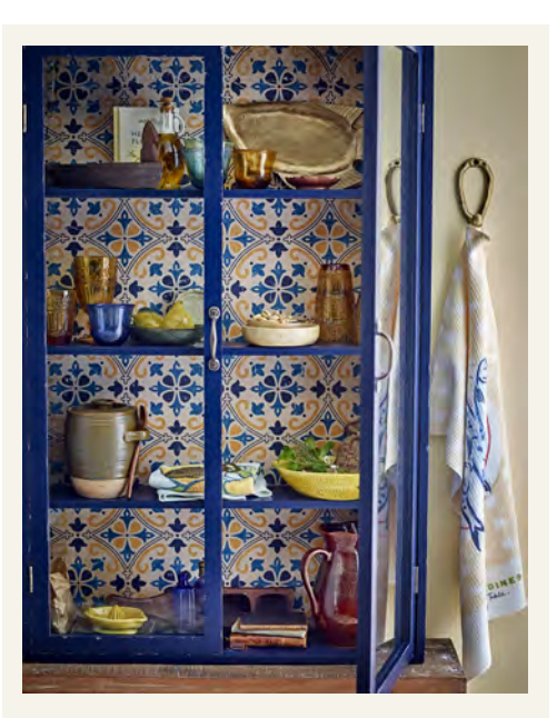
Mediterranean • Page 26

Enjoying authentic living is what Creative Collection is all about; embracing life, all aspects of it, and living it every day.