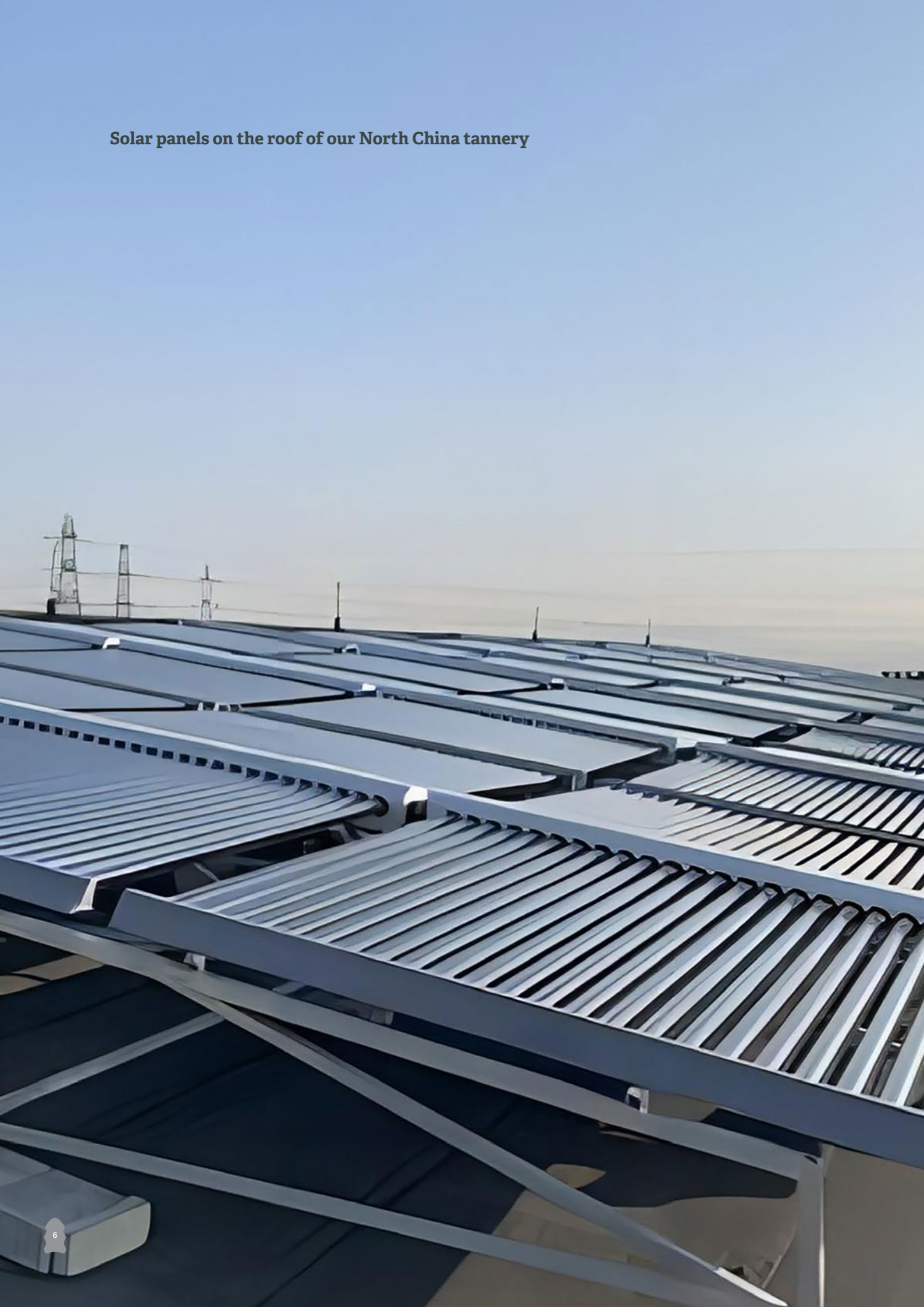
Solar panels on the roof of our North China tannery